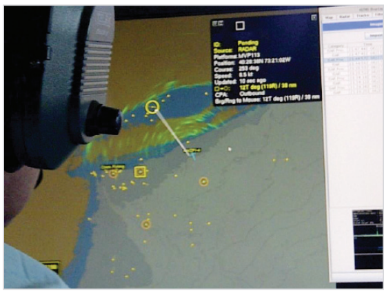
RDR-1700G(V)2 SHARC display during ISAR collection.