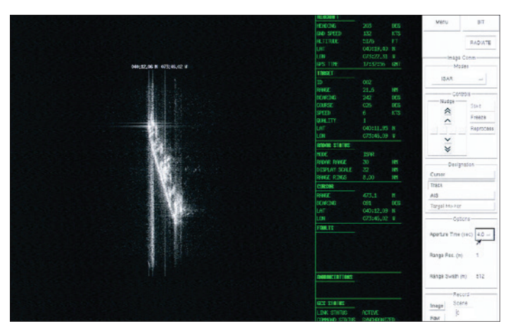
RDR-1700B ISAR image.

With a solid-state transmitter, the radar system provides higher power output and reliability at a small fraction of the cost of competing technologies. On the RDR-1700B model our solid-state transmitter offers markedly lower weight and higher power conversion efficiency over other technologies. As a result, the systems require less than 1 kw of electrical power from the platform.